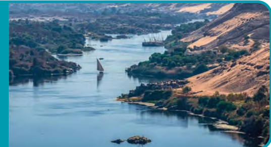
Longest river in the world: The River Nile, Africa