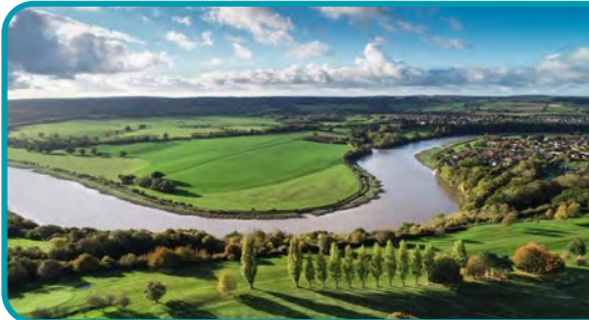
Longest river in the UK: The River Severn.